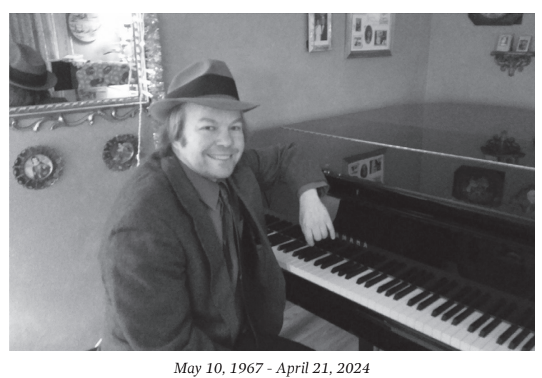
May 10, 1967 - April 21, 2024

Brent, your kindness and music will continue to inspire us.