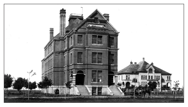
The Main Building and Ladies' Hall (later Davis Hall)