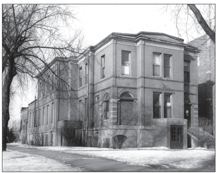
"Old Main," 1958